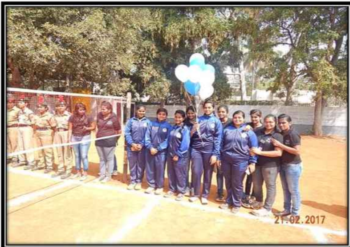
Chamundi Grounds for Intercollegiate outdoor Games