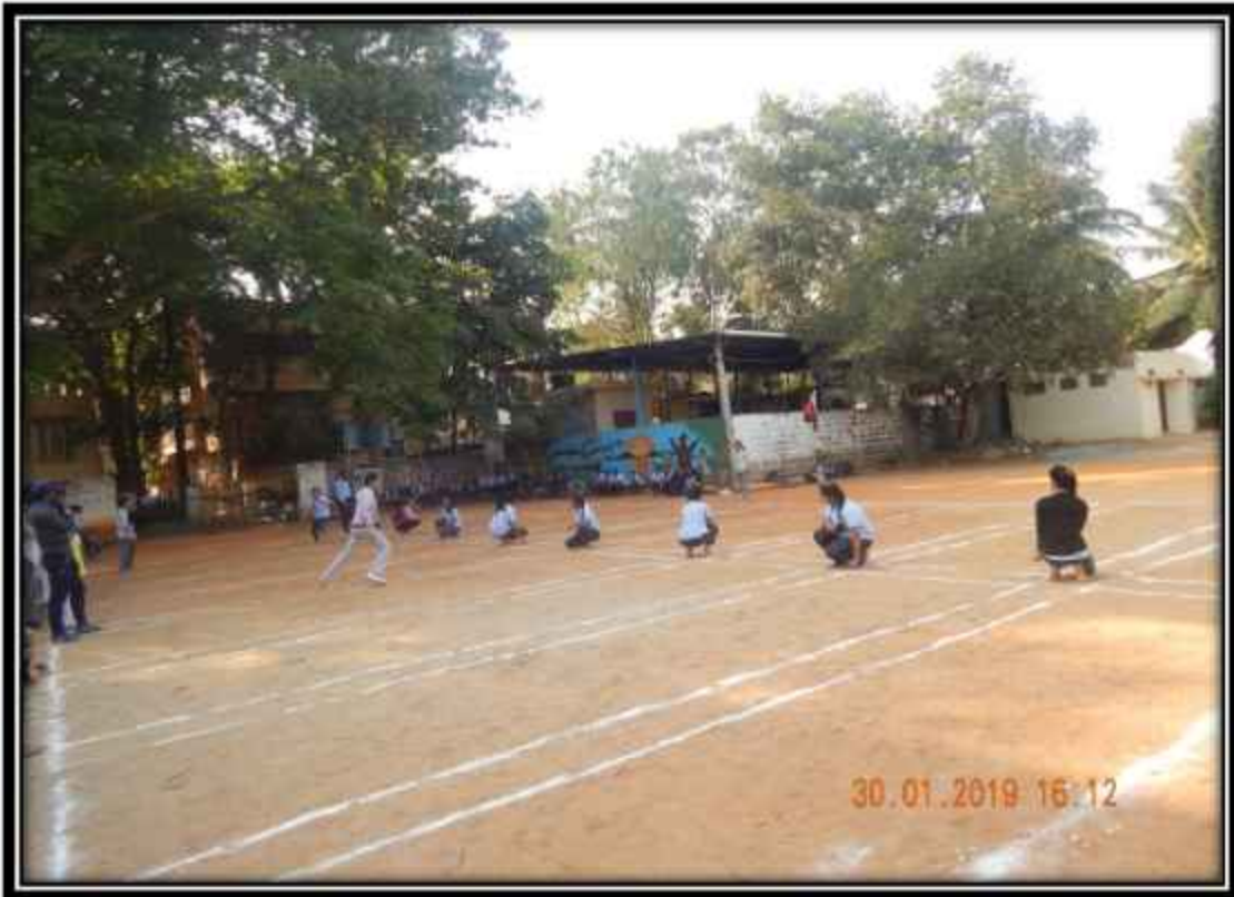
Chamundi Grounds for Interclass outdoor Games