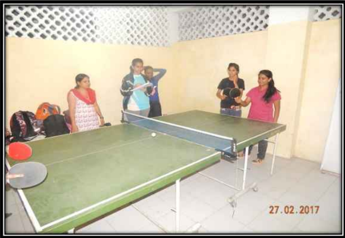
Indoor Games @ Sports Room, MLA Academy of Higher Learning