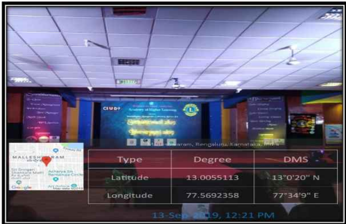
Cultural Activities @ RR Auditorium, MLA Academy of Higher Learning