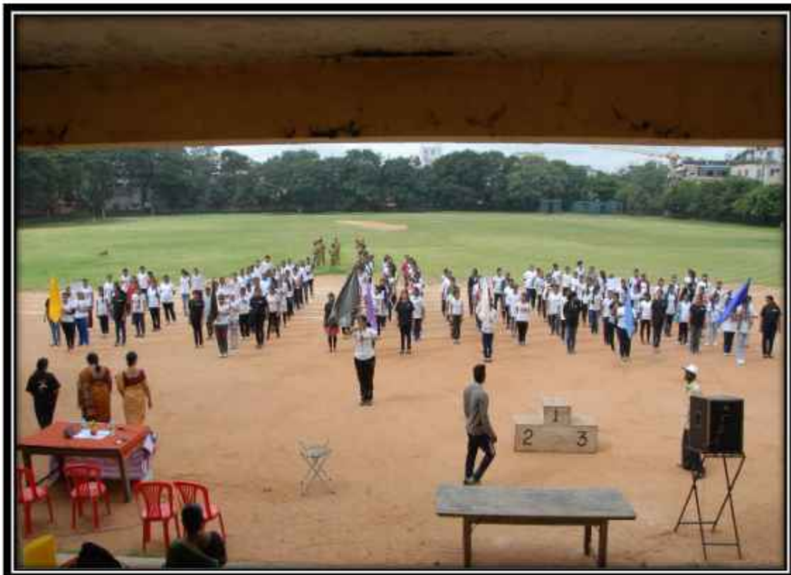
Annual Athletic Meet at Cricket Pavilion Grounds (Central College Grounds)