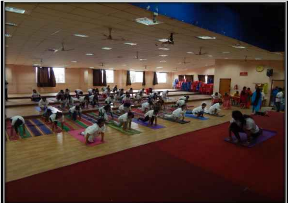
Yoga @ RR Auditorium, MLA Academy of Higher Learning