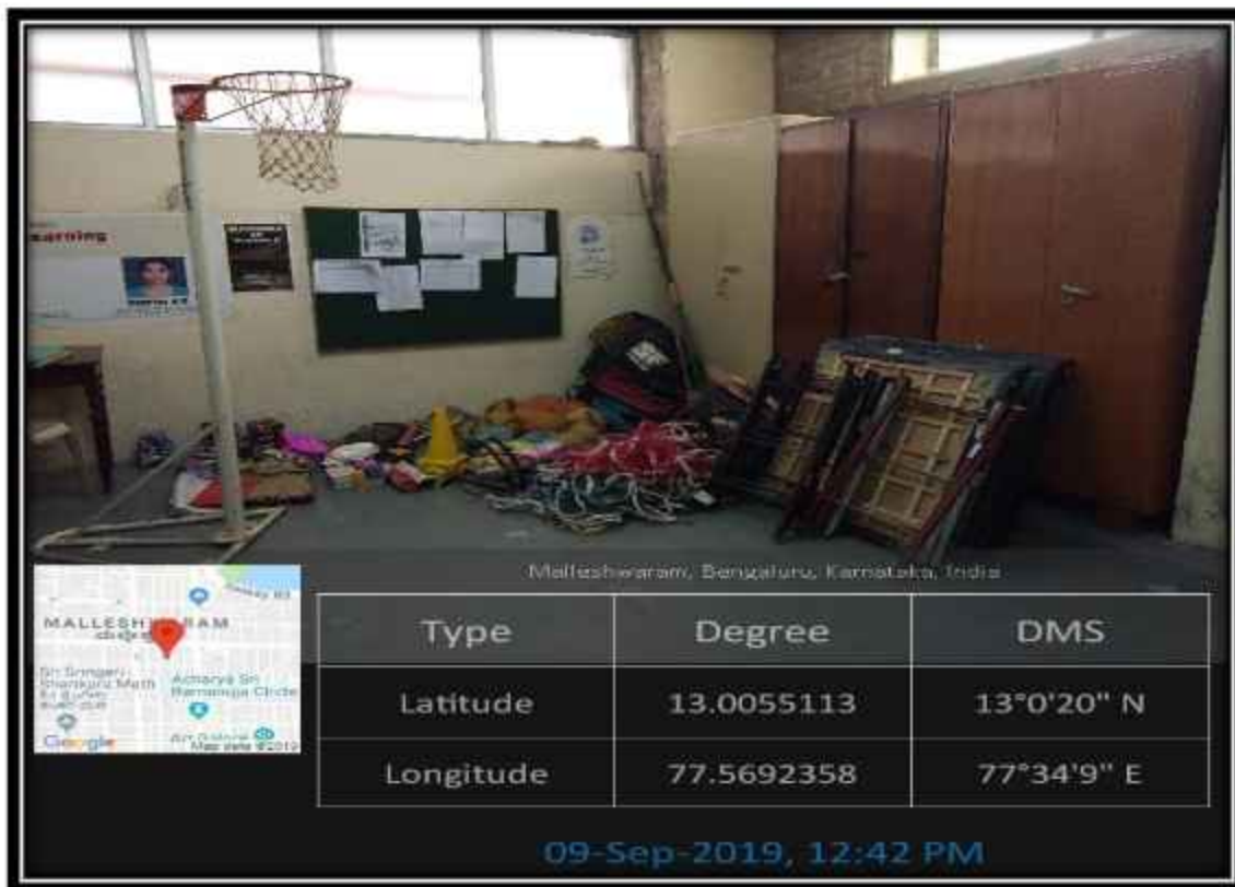
Sport Equipments @ MLA Academy of Higher Learning