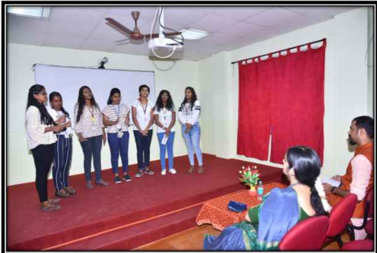
Cultural Activities @Seminar Hall, MLA Academy of Higher Learning