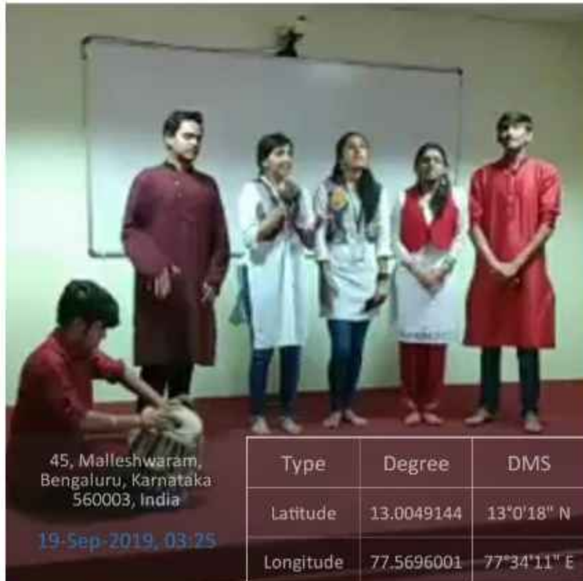
Cultural Activities @Seminar Hall, MLA Academy of Higher Learning