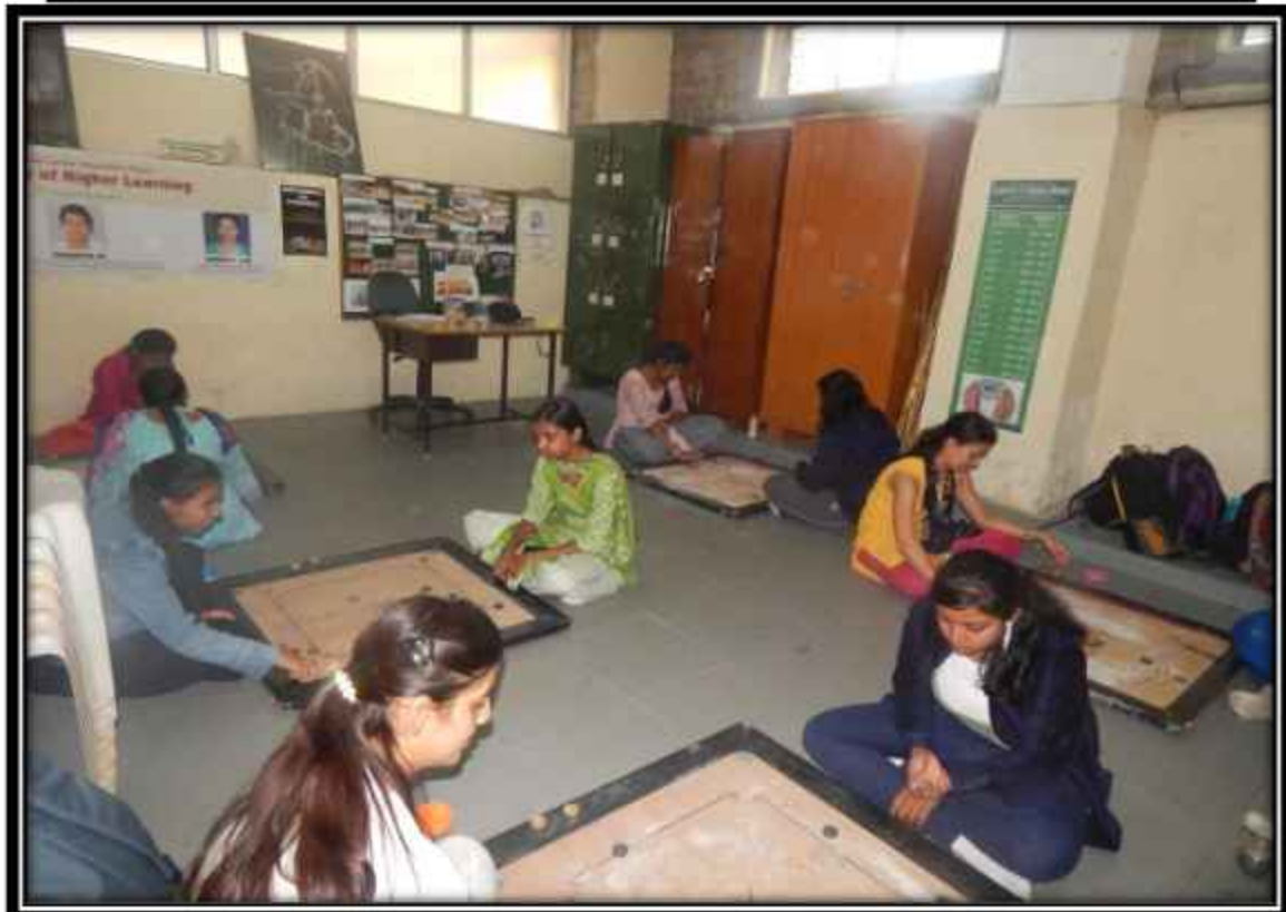
Indoor Games @ Sports Room, MLA Academy of Higher Learning