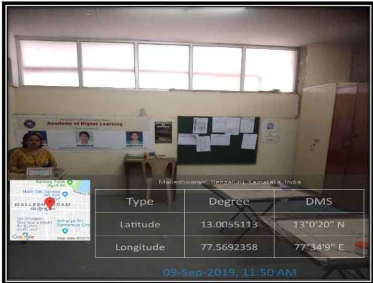
Sports Room @ MLA Academy of Higher Learning