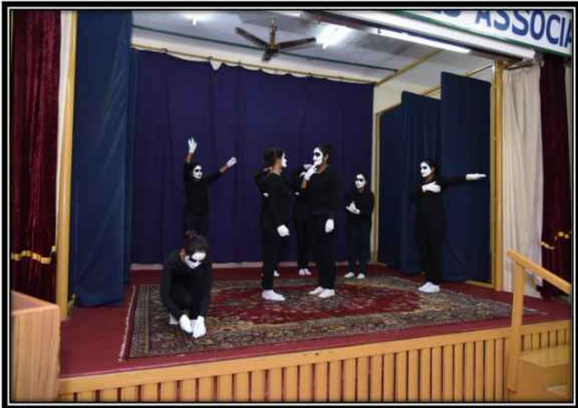
Cultural Activities @ SJ Hall, Malleswaram Ladies Association