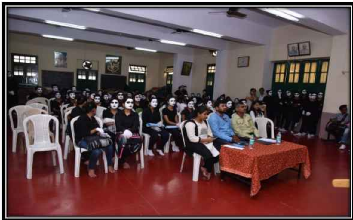
Cultural Activities @ SJ Hall, Malleswaram Ladies Association