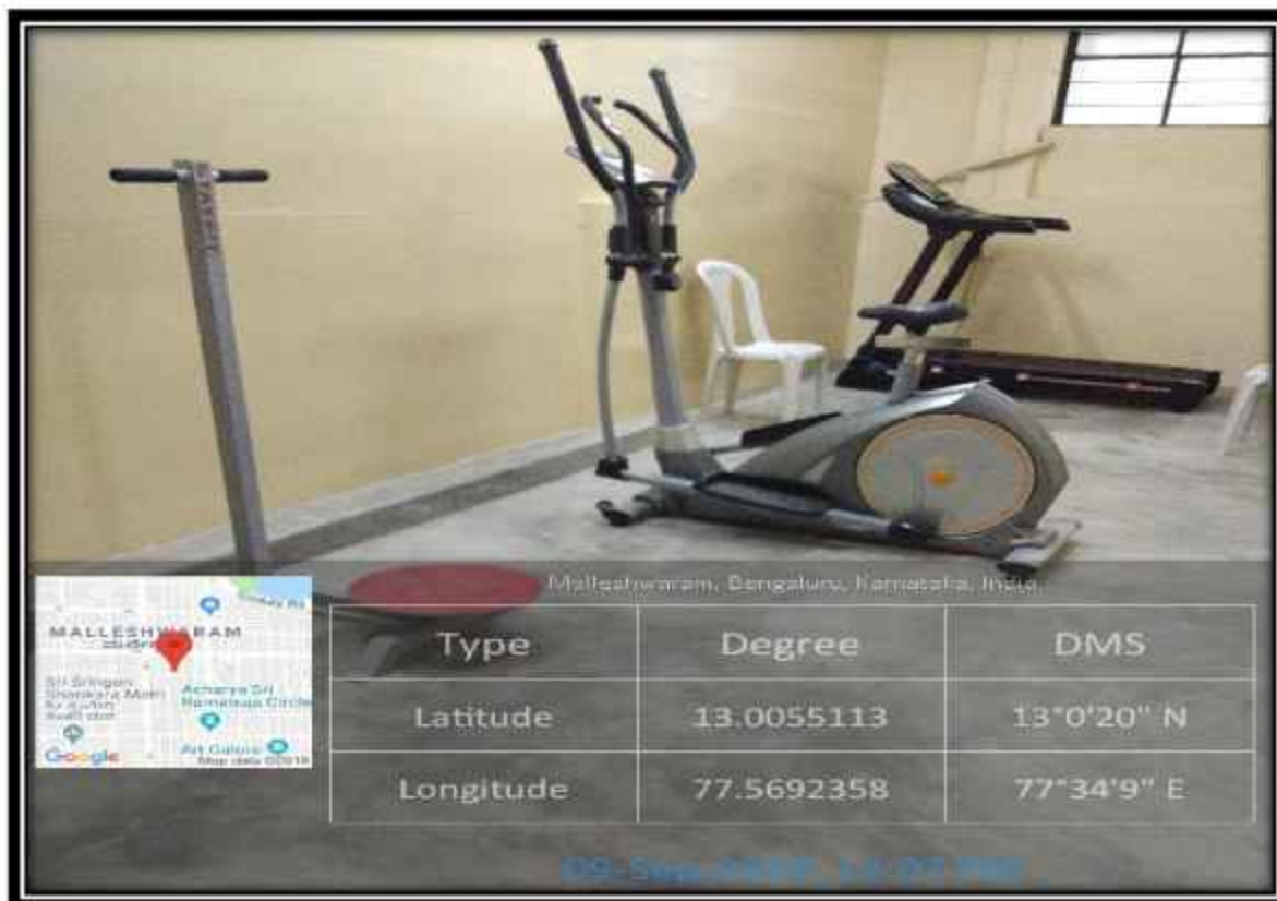
GYM Room @ MLA Academy of Higher Learning