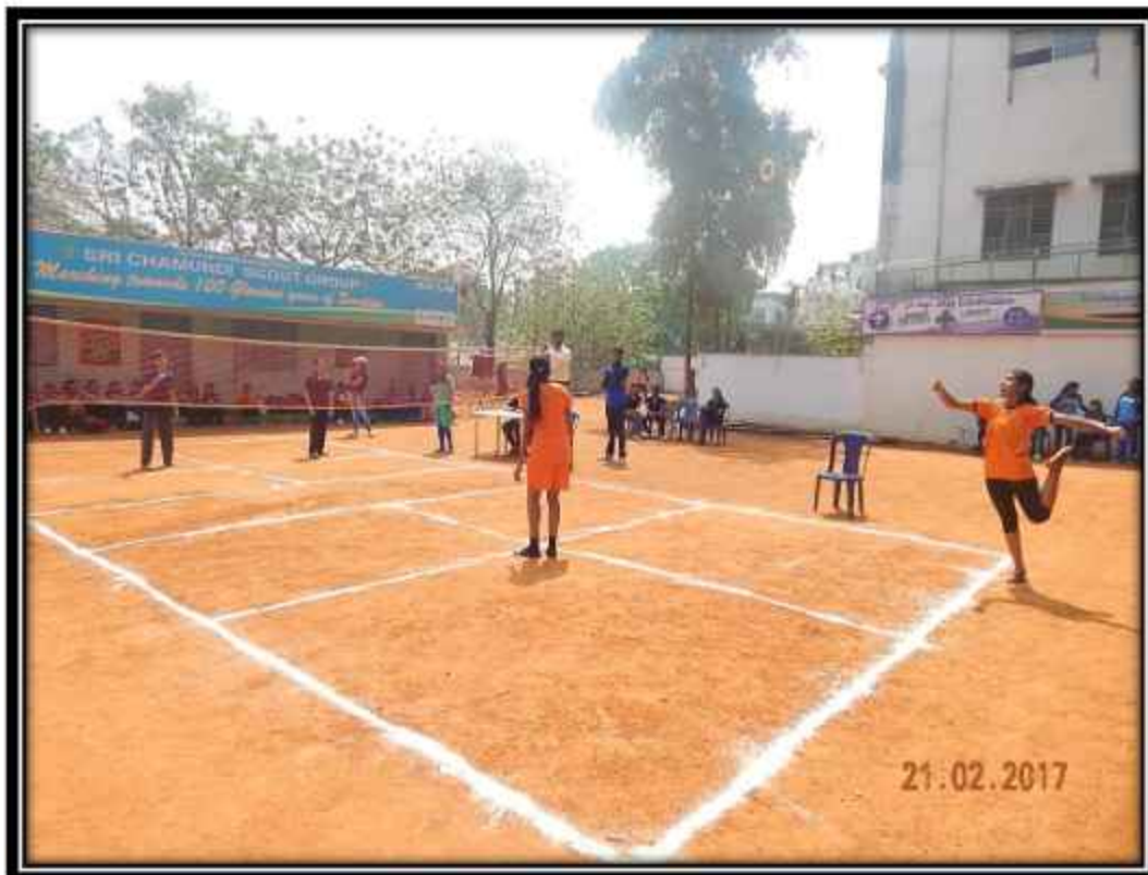
Chamundi Grounds for Interclass outdoor Games